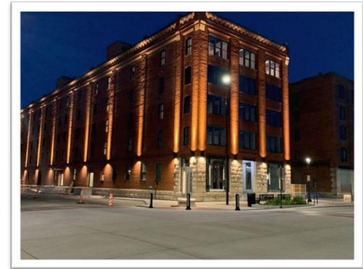
Lee Lofts, Salina