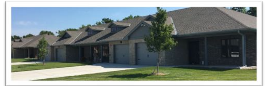
Solana Village Townhomes: McPherson