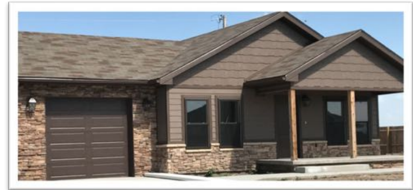
Stony Brook Homes: Scott City, Norton, & Hoxie